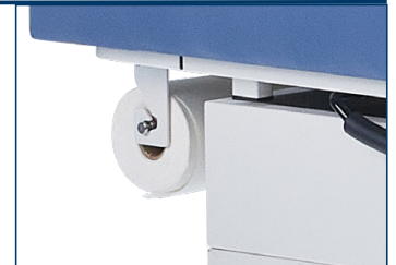
Paper Roll Dispenser