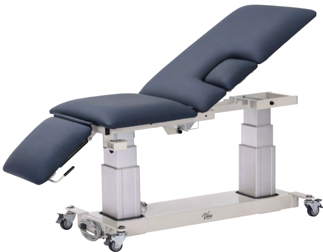
Multi-Use Imaging Power Table with 3-Section Top & Drop Window

Level up your imaging equipment with our Viva Comfort Multi-Use Imaging Power Table with a Three-Section Top & Drop Window – your premier solution for versatile and comfortable imaging procedures. The three-section top design includes a pneumatic adjustable backrest, manual footrest, and a convenient drop window, providing optimal patient positioning for various procedures. To give you a premium imaging table that truly is unmatched, we covered the outfitted 3" padding with antimicrobial upholstery. With an included easy-to-use hand control, the table's height adjustments are effortlessly accessible. The imaging table's design enables a swift and smooth transition in just 16 seconds for height adjustments without load and 27 seconds with a remarkable weight capacity of 550 lbs. The table's adaptable features extend to its Trendelenburg and Reverse Trendelenburg angles, as well as the leg section and backrest adjustments, guaranteeing patient comfort during various medical procedures.