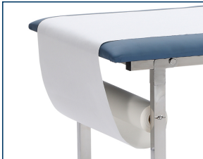
Paper Roll Dispenser