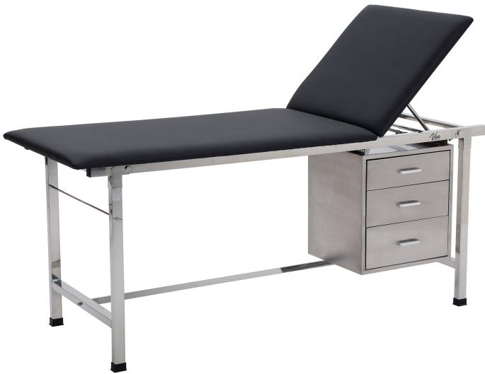
Adjustable Exam Table with Drawers and Paper Dispenser, Black

Upgrade your medical examination experience with our unique Viva Comfort Adjustable Exam Tables. These exceptional medical exam tables redefine convenience and functionality, boasting a unique combination of features that set them apart from all others. To create a safe and hygienic environment, each table is equipped with a built-in paper roll dispenser and paper cutter, allowing for quick liner changing between patients. Additionally, it is outfitted with a 2" thick foam padding to provide superior patient comfort and antimicrobial upholstery, helping guarantee a sterile environment for your patients.