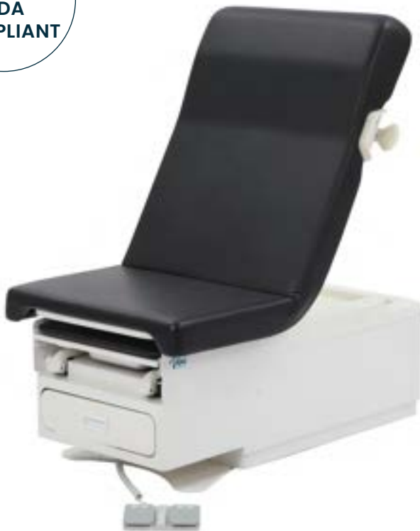
Pointe Power Exam Table, Black