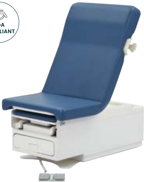
Pointe Power Exam Table, Blue

The Pointe Power Exam Table redefines the medical examination experience, blending functionality with sophistication, making it a must-have for discerning medical professionals. Ergonomically designed, our ADA-compliant exam table features adjustable back and seat sections, allowing you to customize each patient's positioning based on their medical needs. The electric height adjustment controlled by a sleek handheld remote and foot pedal ensures seamless transitions. The gas spring-controlled backrest, which can be maneuvered, and manual-controlled seat rest provide a layer of adaptability, empowering medical personnel with precise adjustments for optimal examination conditions. The outfitted pull-out leg rest can accommodate patients of various heights.