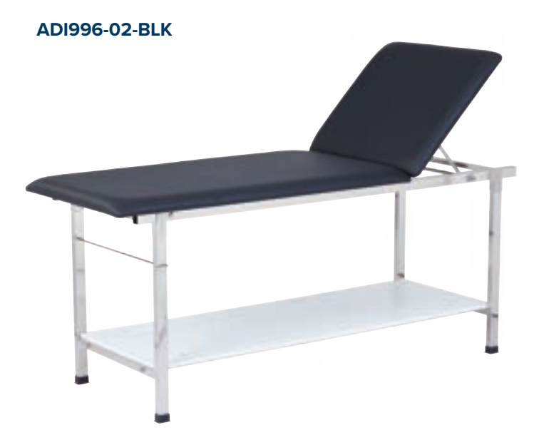
Treatment Table with Shelf and Adjustable Back, Black

Our Treatment Table with Shelf and Adjustable Back is an indispensable asset for any medical facility, engineered to meet the rigorous demands of modern healthcare environments. Its stainless-steel frame offers exceptional durability and easy cleaning, which is ideal for high-traffic medical environments. The adjustable backrest, with multiple recline angles ranging from 0° to 67°, ensures patient comfort during various treatments. When not in use, the foldable leg design and less than 75 lb. body allow for efficient space-saving storage. Our antimicrobial mattress delivers an extra layer of hygiene, which is crucial for maintaining a sterile treatment environment. The integrated paper roll dispenser reassures a sanitary space for your patients. The outfitted shelf will help provide convenience for medical supplies, as well as spare exam paper rolls.