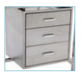
Compatible With Our Optional Accessory ADI996-01-DR-3: 3 Drawer Set