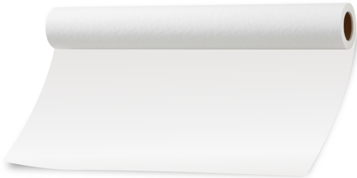
18" x 225' Exam Table Paper Roll

ADIME916-S-18 ADIME916-S-21 ADIME916-C-18 ADIME916-C-21