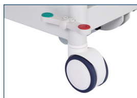
5" Lockable Caster Wheels