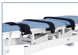
Chest, Waist and Leg Security Straps